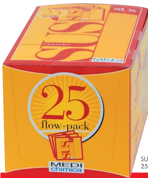
SUS: 25 pcs. package

Developed for use in large Artificial Insemination centres and in band managed farms, thank to its quality, efficiency and durability features.