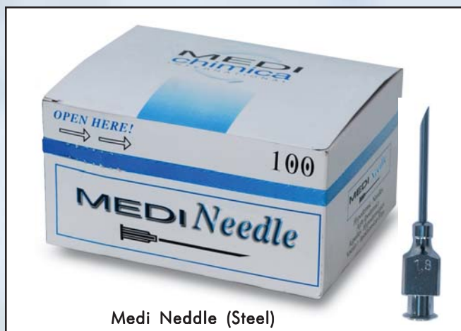
Medi Needle (Steel)