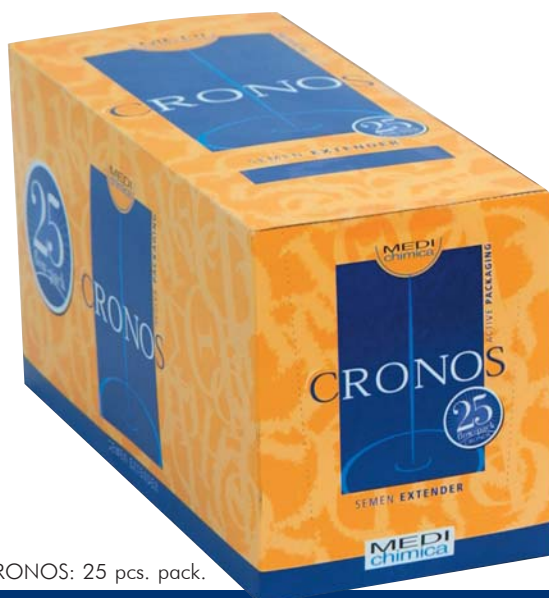
CRONOS: 25 pcs. pack.